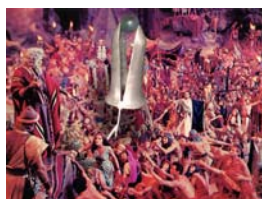
Israelites, 1956/2019, digital collage, 61 x 46 cm, 8 éditions