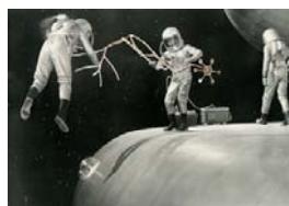
Space Engineers, 1962/2019, digital collage, 61 x 48 cm, 8 éditions