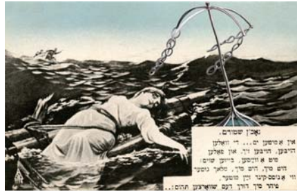
Hebrew Maiden 2017, Archival Inkjet Print, 61 x 39 cm, 8 éditions