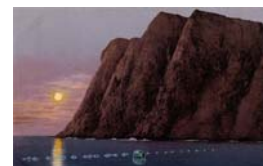
Midnight Sun 2017, Archival Inkjet Print, 61 x 39 cm 8 éditions