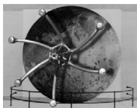
The Moon, 1934/2019, digital collage, 61 x 48 cm, 8 éditions