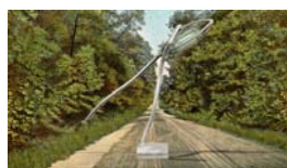
Country Road, 1929/2019, digital collage, 61 x 33 cm, 8 éditions