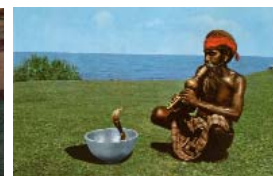
Snake Charmer, 1967/2019, digital collage, 61 x 39 cm, 8 éditions