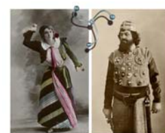
Assassination, 1896/2019, digital collage, 66 x 53 cm, 8 éditions