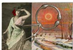
Eclipse, 1890/2019, digital collage, 61 x 42 cm, 8 éditions