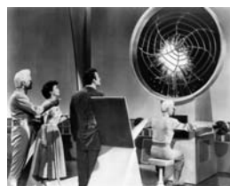
Explosion in Space, 1957/2019, digital collage, 61 x 48 cm, 8 éditions