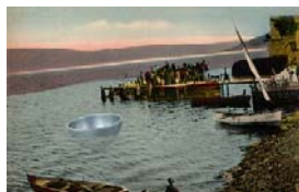
Sea of Galilee, 1905/2019, digital collage, 61 x 39 cm, 8 éditions