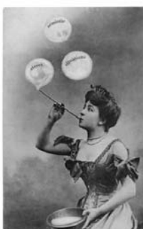
Daydream, 1900/2019, digital collage, 66 x 43 cm, 8 éditions