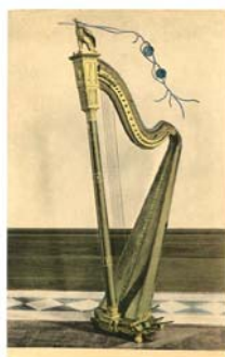
Josephine's Harp, 1900/2019, digital collage, 61 x 46 cm, 8 éditions