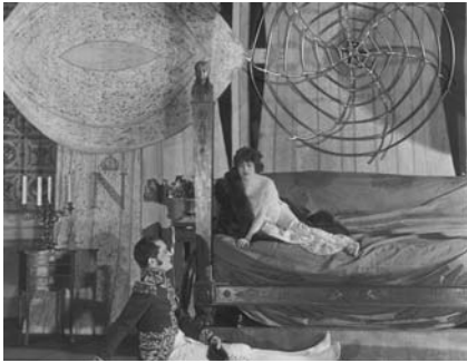
Napoléon 2017, Archival Inkjet Print, 61 x 60 cm, 8 éditions