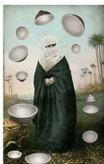
Dame turque, 1903/2019, digital collage, 61 x 38 cm, 8 éditions