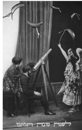
Stargazing 2017, Archival Inkjet Print, 61 x 42 cm Edition of eight