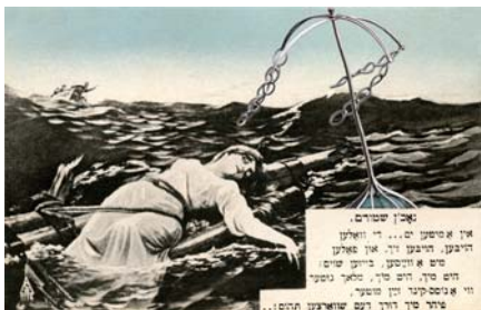
Hebrew Maiden 2017, Archival Inkjet Print, 61 x 39 cm Edition of eight