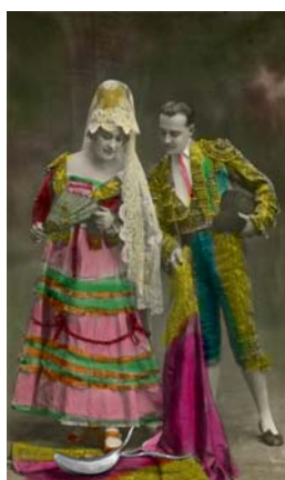
Toréador 2017, Archival Inkjet Print, 61 x 36,5 cm Edition of eight