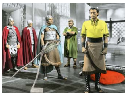
King David 2017, Archival Inkjet Print, 61 x 46 cm Edition of eight