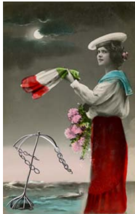
Royal Fleet 2017, Archival Inkjet Print, 61 x 38.5 cm Edition of eight