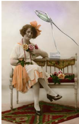
Bonne Année 2017, Archival Inkjet Print, 61 x 40 cm Edition of eight