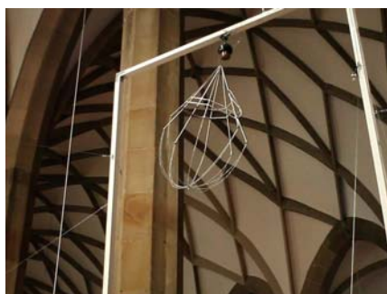
Oculus Loop 2017, HD Videon 27:27