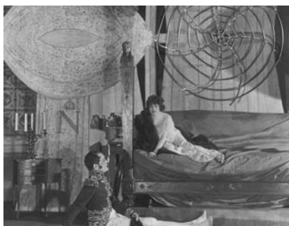
Napoléon 2017, Archival Inkjet Print, 61 x 60 cm Edition of eight