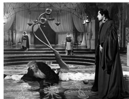
Herod 2017, Archival Inkjet Print, 61 x 47 cm Edition of eight