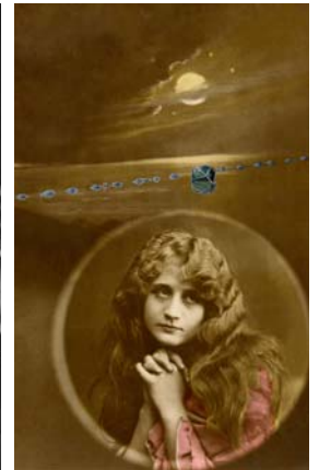
Espérance 2017, Archival Inkjet Print, 61 x 39 cm Edition of eight