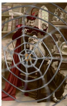
Faustian Bargain 2017, Archival Inkjet Print, 61 x 44,5 cm Edition of eight