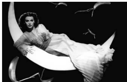
Woman in the Moon 2017, Archival Inkjet Print, 61 x 48 cm Edition of eight