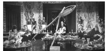
Feast 2017, Archival Inkjet Print, 61 x 30 cm Edition of eight