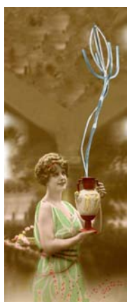
Amphora 2017, Archival Inkjet Print, 91 x 38 cm Edition of eight