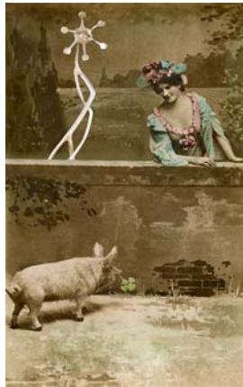
Shamrock 2017, Archival Inkjet Print, 61 x 38 cm Edition of eight